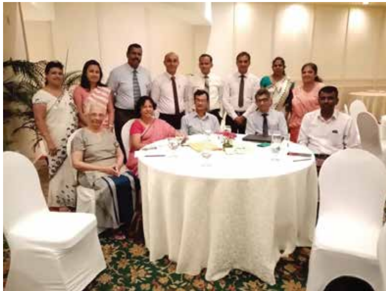
Marga Team with the participants of the research methodology course conducted for the National Police Commission at the final session at Golden Pond, Taj Samudra Hotel.