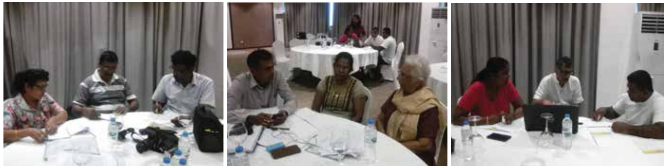
National Police Commission staff carrying out their group work at the training programme