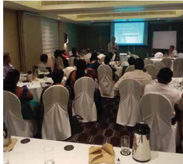
1st day of the training programme at Renuka Hotel Colombo